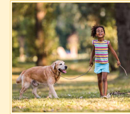
5 GREEN SPACES AND PARKS Family members, young and old (and furry!), will enjoy walking, picnicking and playing on the green spaces and parks throughout our community.