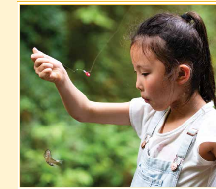
6 FISHING POND You can end up with a small catch—as well as regale the kids and grandkids with some small and fall tales—while visiting and casting on our fishing pond.