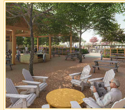
2 EXCLUSIVE AMENITY CENTER Relax and lounge under the sun, or gather 'round for the next big community event or family celebration. It all happens here!