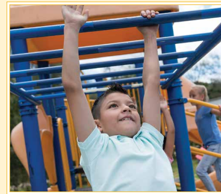
3 FUN PLAYGROUNDS Our fun playgrounds come complete with energetic ways for kids to explore and make friends, as well as green spaces to play ball.