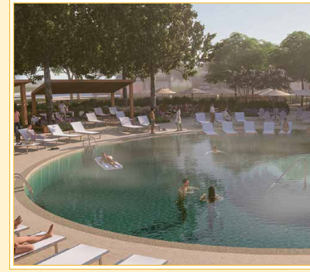
1 RESORT-STYLE POOL Our beautiful pool, perfect for cooling off in the summer heat, is surrounded by deck chairs and cabanas. Ideal for catching some sun—or enjoying some shade—while visiting with friends and neighbors.