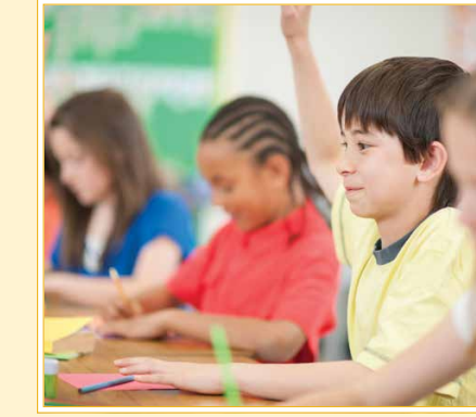
4 ON-SITE ELEMENTARY SCHOOL With Pleasant View Elementary School newly opened within our own community, SILO MILLS students are provided an accessible education at the outset.

- may be altered, relocated, or removed without prior notice. Additionally, builder prices, lot sizes, floor-plan availability and specific site offers are subject to change without notice. Please contact the on-site builder representative for up-to-date and detailed information. March 2024